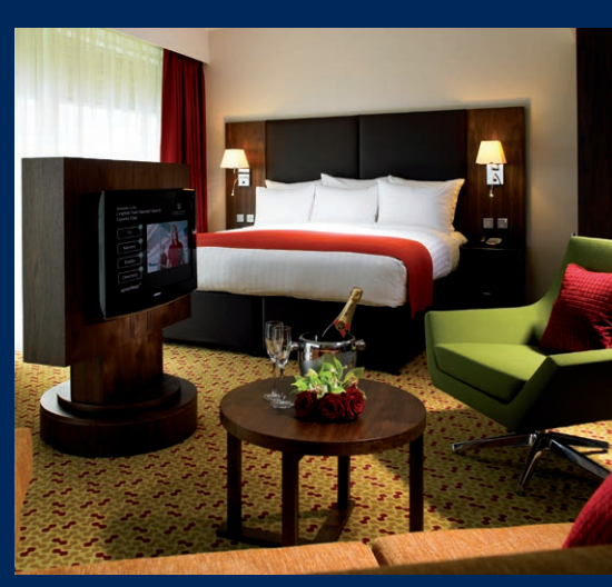
Lingfield Park Marriott Hotel & Country Club

"Our clients design their luxury experience to stretch beyond the elegant interiors, private facilities and personal service, with the same luxurious care and attention given to creating the very best sleep experience."